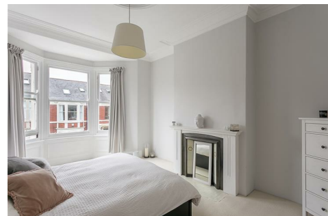
679 sq.ft. (63.1 sq.m.) approx.