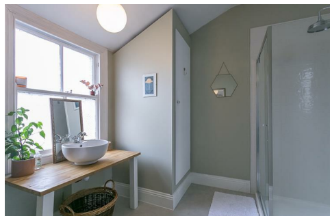
818 sq.ft. (76.0 sq.m.) approx.

Available 2nd March 2026 | £1,650pcm | Victoria Terraced House | 1,497 Sq. ft (139.1 m 2 ) | Fantastic Family Home | Highly Sought After Location | Three Bedrooms | Lounge | Dining Room | Extended Kitchen/Diner | Family Bathroom WC | Separate WC | Period Features | Private Rear Yard | On Street Parking | Furnished | GCH | Council Tax Band: C | EPC Rating: D